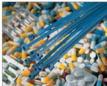
A safe and contamination free production process with MCT.