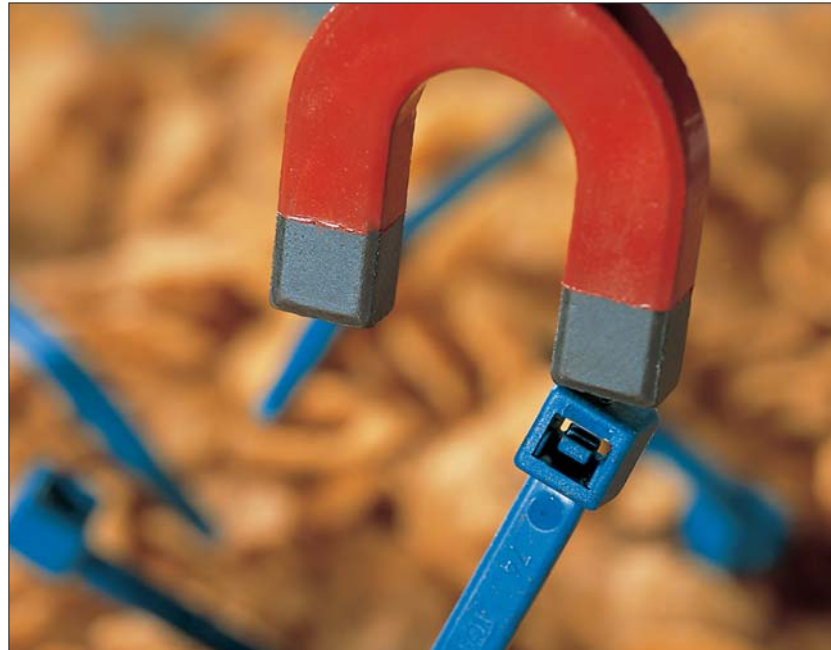
The MCT with metal content.

The Metal Content Tie is a cable tie specifically designed for use in the food & pharmaceutical processing industries. A unique manufacturing process, involving the inclusion of a metallic pigment, enables even small 'cut-off' sections of the tie to be detected by standard metal detecting equipment. Ideally suited for the installation of cabling in and around the manufacturing process.