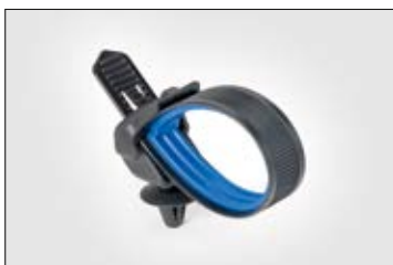
With arrowhead, with disc, for round holes