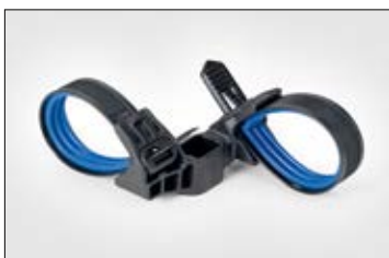
For weld studs, for parallel routing

All dimensions in mm. Subject to technical changes.