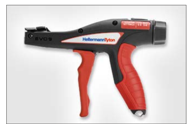
The EVO9 with TLC-Technology.