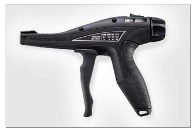
The EVO7: Maximum performance with minimum effort.