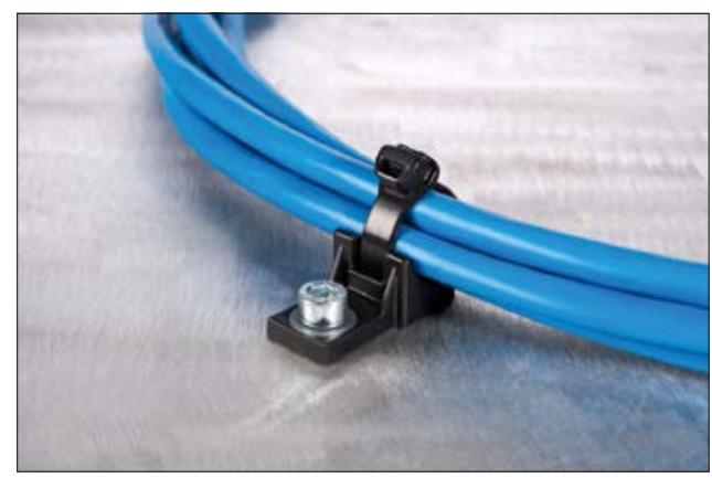
X-series provides a superior fixing solution for tight applications.